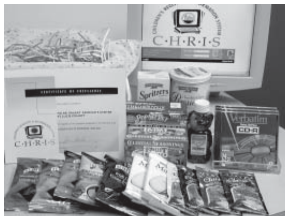
CHRIS Gift Basket (monitor not included)

Crown Associate Center Galaxy Associate Center, St. Lucie County Gulfcoast Associate Center, Hernando County Hillsborough Associate Center