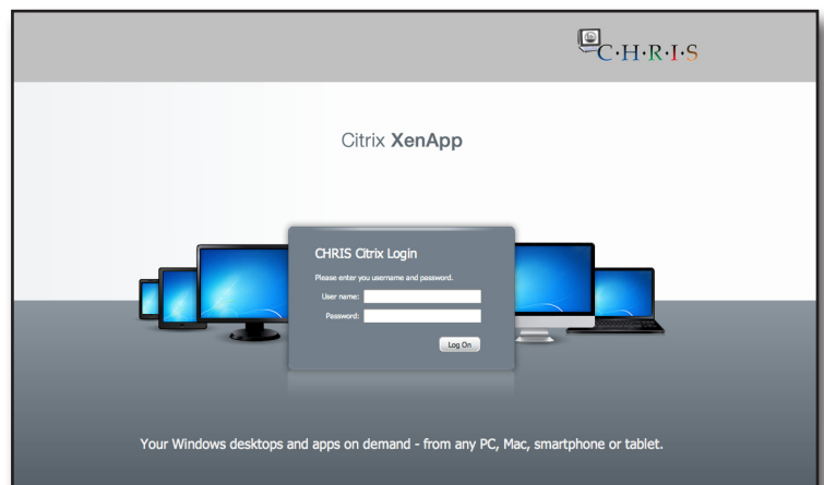
Figure 3: New Citrix Login Page