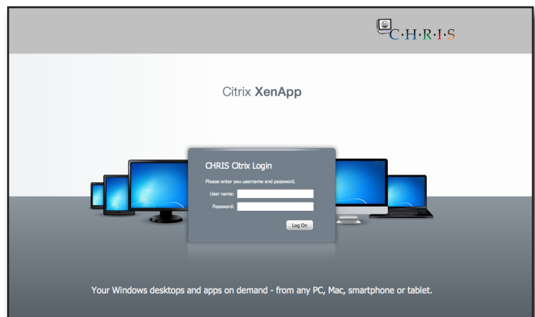
Figure 3: New Citrix Login Page