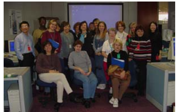
FDLRS/Action Associate Center