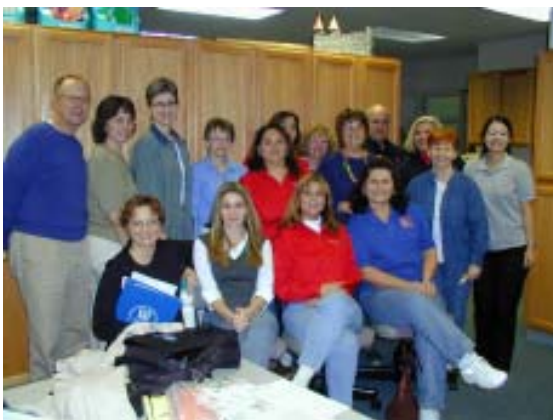
FDLRS/Sunrise Associate Center