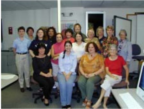
FDLRS/Sarasota Associate Center

Last Fall, we began a CHRIS Plus New User Training Tour targeted at all of our CHRIS users. We visited 12 centers around the State. All of the trainings were a success and we would like to thank the center managers, DBAs, and staff that assisted in coordinating these sessions.