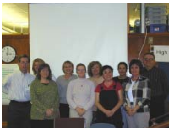
FDLRS/Gulfcoast Associate Center