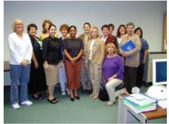
FDLRS/East Associate Center