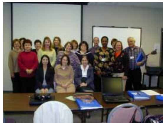
FDLRS/Crown Associate Center