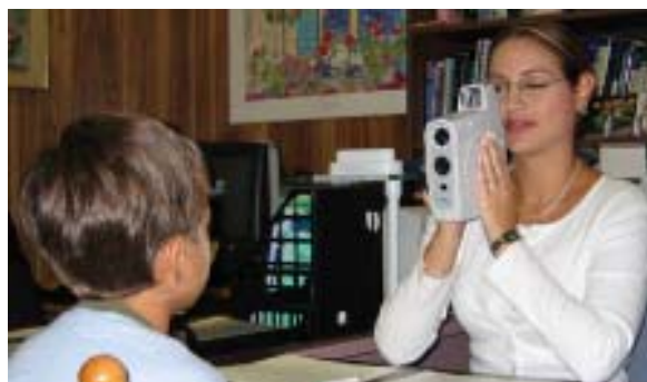
FDLRS/South Associate Center Staff Member Performing a Vision Screening