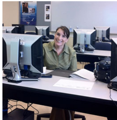
Data Facilitator Training FDLRS/South

CHRIS offers a variety of training sessions. If you have six or more users, training sessions can be conducted at your site. Training sessions for fewer than six users are conducted at the CHRIS offices at the University of Miami. One-on-one training sessions are available for experienced users. To schedule a training session, contact Cory Beermann at cory@miami.edu or visit the Training page on the CHRIS website at http://www.chris.miami.edu/training.htm .