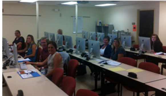
New User Training FDLRS/Gulfcoast

Over the past few months we conducted one Data Facilitator training session and three New User training sessions. Thanks to Florida Diagnostic and Learning Resources System (FDLRS)/Gulfcoast, FDLRS/South, and FDLRS/Sunrise for hosting these training sessions.