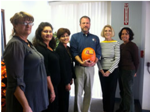
New User Training FDLRS/Sunrise